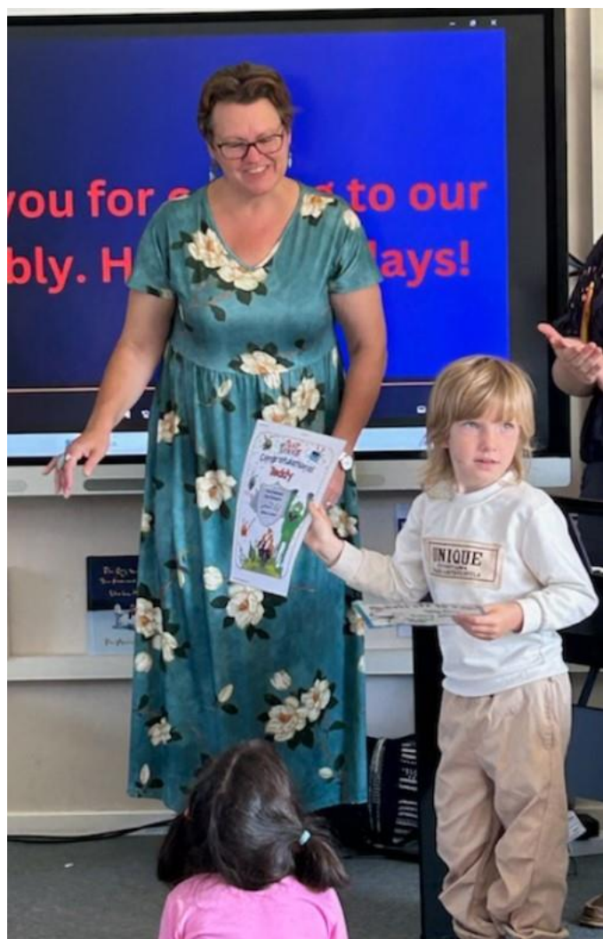
A few photos of our Term 1 Assembly and Easter Hat Parade